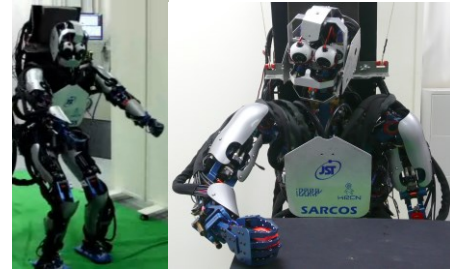
Figure 2. Humanoid robot CB-i.